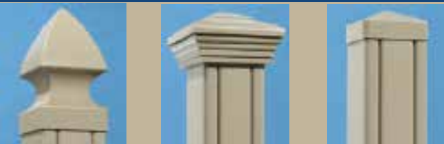
Gothic Cap New England Cap Pyramid Cap